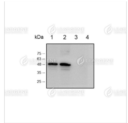
Western blotting analysis of Mouse anti-SARS-CoV & CoV-2 NP mAb, clone 102-7 (1:1000)

Disclaimer : For Research Use or Further Manufacturing Only.