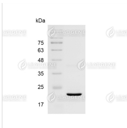
SDS-PAGE analysis of recombinant UniHRV 3C Protease Protein

UniHRV 3C protease removes the purification tag appended to interest proteins after the affinity chromatography step.